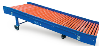
COATED ROLLER INCLINES