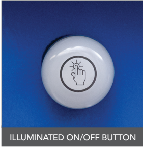
ILLUMINATED ON/OFF BUTTON