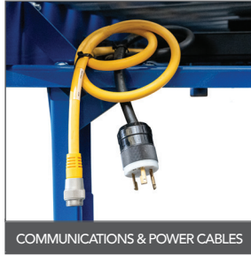
COMMUNICATIONS & POWER CABLES