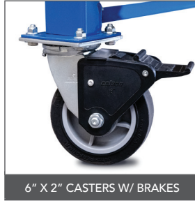
6" X 2" CASTERS W/ BRAKES