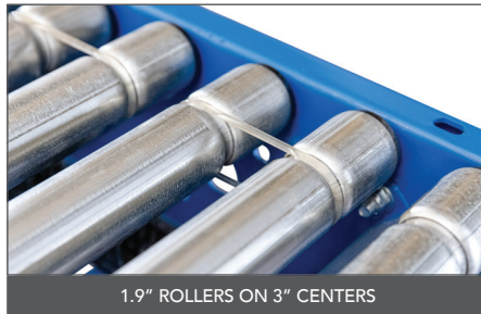
1.9" ROLLERS ON 3" CENTERS