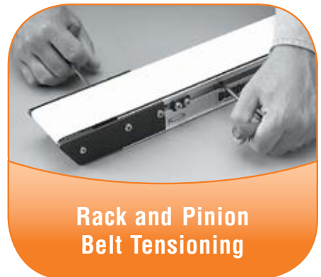
Rack and Pinion Belt Tensioning