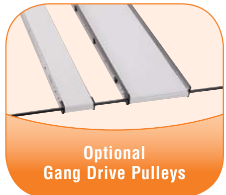
Optional Gang Drive Pulleys