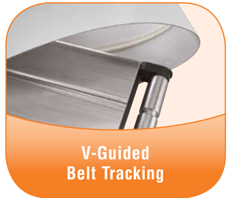
V-Guided Belt Tracking